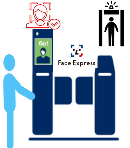
Entering security check point