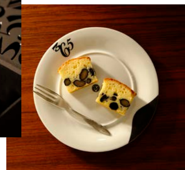
Black Bean Pound Cake

For a limited time only, Swiss luxury watch brand, Franck Muller, which celebrated its 25th anniversary this year, will open a café space, FRANCK MULLER 365 Port of VANGUARD, on the theme of the “Vanguard™,” the neo-futuristic watch that symbolizes the Franck Muller of today. The café also has a take-out menu featuring Franck Muller-original items such as Daiginjo Chocolat and Black Bean Pound Cake.