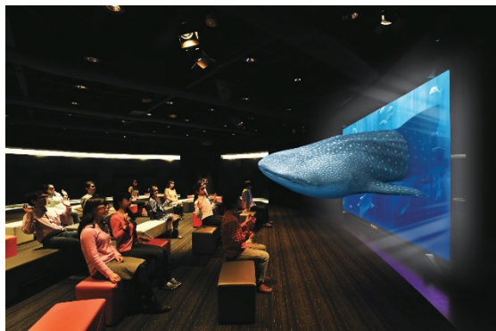
* Images courtesy of Sony. (3D image as shown at the Sony Aquarium in 2010)