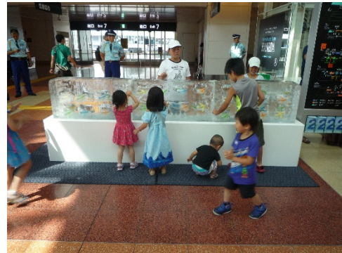
Last year's event