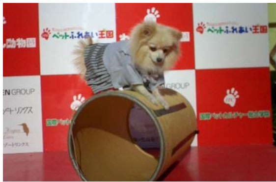
* Details of actual performance may differ

A wide variety of special events will be held during the summer months at Domestic Terminals 1 and 2 of Haneda Airport. We hope these events will help put our customers in a summer mood and will become part of people's happy memories of the summer.