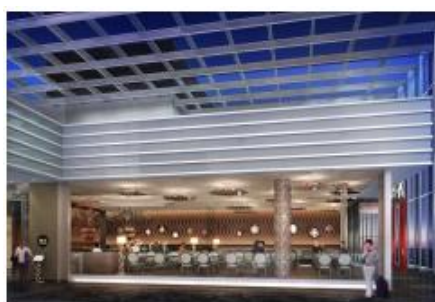
(Cafe & Lounge)

Leaving the departure lobby, guests will walk through the hotel’s First Gate (4th floor of the hotel) and past an open cafe and lounge on the right. They will soon be greeted by bell staff at the Second Gate with a suitcase motif. Ahead of them next will be a front desk and lobby area with a vibrant atmosphere created by a design representing travel around the world. This approach to the hotel is expected to stir the guests’ sense of anticipation for the journey awaiting them.