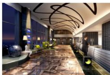
(Front Desk & Lobby Area)