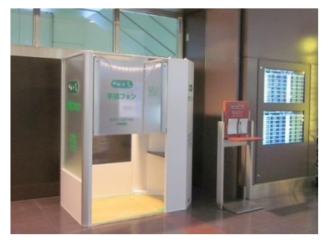
Departure Lobby, 2<sup>nd</sup> floor, Terminal 1